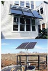
Solar PV Systems