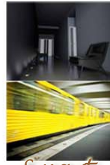
Smart Emergency & Detection