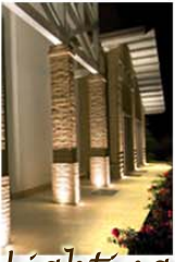
Lighting Fixtures & Components