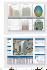
Automation, BMS Lighting Integration