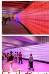
Lighting Controls & Systems