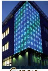
Green Buildings Systems